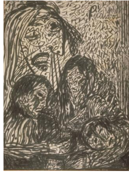
Title: Los Perdidos and the Crying Women Date: 1981 Primary Maker: Italo Scanga Medium: charcoal on paper