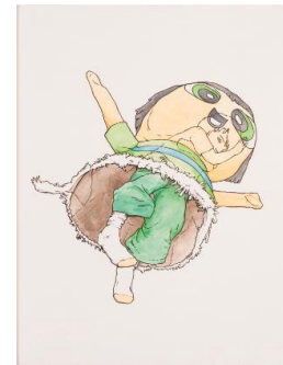
Title: Undocumented Interventions #1