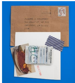
Title: Untitled Travel Collage, December 27, 1990 Date: 1990 Primary Maker: Stephen Antonakos Medium: blue paper background, tan envelope addressed to Michael Krichman postmarked Düsseldorf 12.11.90, white paper rectangle with red ink stamp DEC 27 1990, bit of blue striped paper, image of pastrami sandwich, United Airlines ticket stub with artist's name