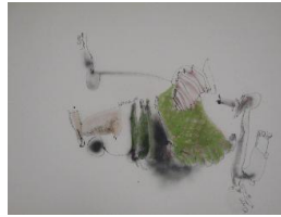
Title: Sawtelle Series