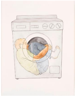
Title: Undocumented Interventions #2 Date: 2005 Primary Maker: Julio Cesar Morales Medium: watercolor on paper, edition 1 of 5