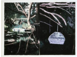
Title: Old House Lane #16 Date: 1986 Primary Maker: Jennifer Bartlett Medium: pastel on two sheets of rives paper