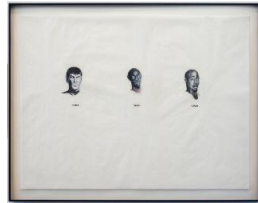
Title: Spock, Tuvac, Tupac