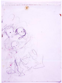
Title: Preliminary artist's sketch for "Untitled" (Prisspaper with Blue Hair) Date: 1998 Primary Maker: Kim Dingle Medium: graphite on paper