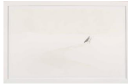
Title: Flash Flood Overflow Structure Date: 2004 Primary Maker: Adam Belt Medium: acrylic and graphite on paper