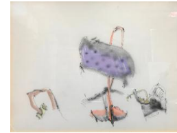
Title: Sawtelle Series