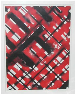
Title: Untitled Date: 1981 Primary Maker: Ed Moses Medium: watercolor on paper