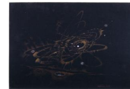
Title: Untitled Date: 1970 Primary Maker: Lee Bontecou Medium: colored pencil on black paper