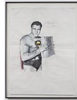
Title: Found Something Date: 1996 Primary Maker: Edgar Arceneaux Medium: graphite, gesso, acrylic on frosted vellum