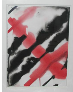
Title: Untitled Date: 1982 Primary Maker: Ed Moses Medium: watercolor on paper