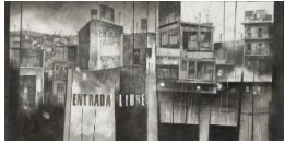
Title: Linea - Escaparates de Tijuana 1-4 / Line - Tijuana Cityscapes 1-4 Date: 2003 Primary Maker: Hugo Crosthwaite Medium: pencil and charcoal on wood panel