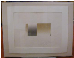
Title: Untitled AF #9 Date: 1978 Primary Maker: Larry Bell Medium: vaporized metals on paper in an acrylic box