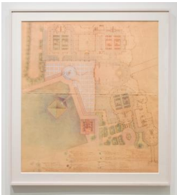
Title: Three Primary Forms (Battery Park City World Financial Center)

Medium: lithograph on blue paper, edition 4 of 15