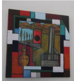
Title: Untitled Date: 1988 Primary Maker: Italo Scanga Medium: watercolor