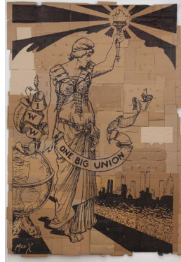
Title: One Big Union Date: 2012 Primary Maker: Andrea Bowers Medium: felt-tip marker on found cardboard