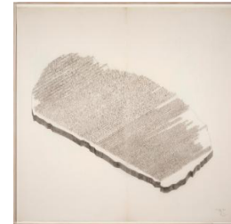
Title: The Rosetta Stone City Date: 1985 Primary Maker: Alice Aycock Medium: pencil on Mylar