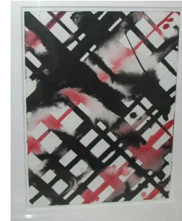
Title: Untitled Date: 1981 Primary Maker: Ed Moses Medium: watercolor on paper