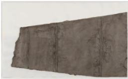
Title: Sometimes walls can't be helped

Medium: pen and ink and watercolor on paper