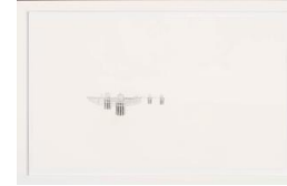
Title: Hoover Dam Intake Towers Date: 2004 Primary Maker: Adam Belt Medium: acrylic and graphite on paper