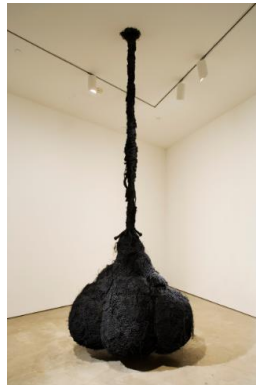
Title: Untitled #676 (Shaggy Dog) Date: 1990 Primary Maker: Petah Coyne Medium: black sand from pig iron casting, chicken-wire fencing, electric fence wire, wire, catalytic converter, shaved car hair, CelluClay, Acrylex, cable, cable nuts, cable clips, thimbles, S-hook, PVC pipe, paint, steel, nylon rope, sisal, jaw-to-jaw swivel, quick-link shackles, turnbuckle