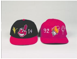
Title: 1492 Indians vs. Dukes Date: 1993 Primary Maker: Rubén Ortiz Torres Medium: stitched lettering and airbrushed inks on baseball caps