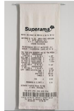
Title: Untitled (superama) Date: 2003 Primary Maker: Gabriel Kuri Medium: handwoven Gobelins