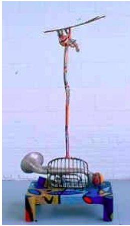
Title: Bombardino (Animal in Danger) Date: 1984 Primary Maker: Italo Scanga Medium: wood, oil, rake, thorns, horn