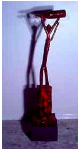
Title: Fear of Drinking (Female) Date: 1980 Primary Maker: Italo Scanga Medium: wood, oil, bottle, wire