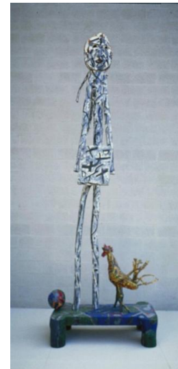
Title: Monte Cassino: Betrayal of the Intellectuals Date: 1983 Primary Maker: Italo Scanga Medium: oil on wood