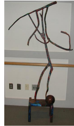
Title: Figure Holding Himself Date: 1986 Primary Maker: Italo Scanga Medium: painted wood