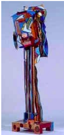
Title: Meta VII (Thoughts on Baseball) Date: 1986 Primary Maker: Italo Scanga Medium: oil on wood