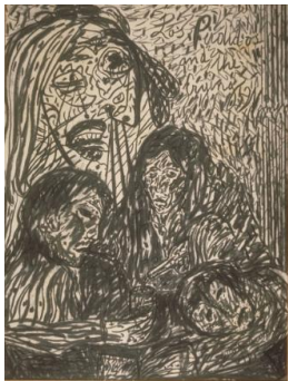
Title: Los Perdidos and the Crying Women Date: 1981 Primary Maker: Italo Scanga Medium: charcoal on paper