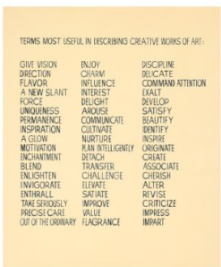
Title: Terms Most Useful in Describing Creative Works of Art Date: 1966-1968 Primary Maker: John Baldessari Medium: acrylic on canvas