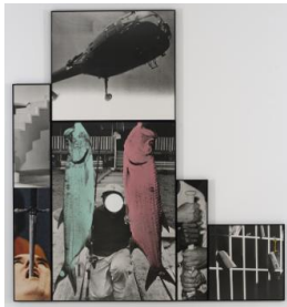
Title: Two Fish Date: 1988 Primary Maker: John Baldessari Medium: black-and-white and color photographs with oil tint and vinyl paint