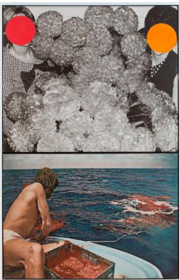
Title: Stain Date: 1987 Primary Maker: John Baldessari Medium: vinyl paint and oil tint on black-and-white photograph