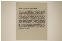
Title: Composing on a Canvas Date: 1966-1968 Primary Maker: John Baldessari Medium: acrylic on canvas